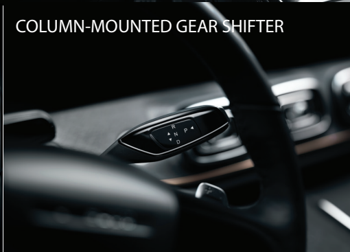
COLUMN-MOUNTED GEAR SHIFTER