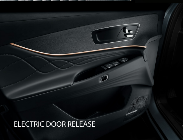
ELECTRIC DOOR RELEASE