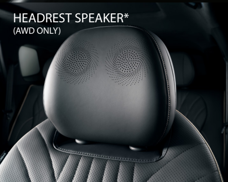
HEADREST SPEAKER* (AWD ONLY)