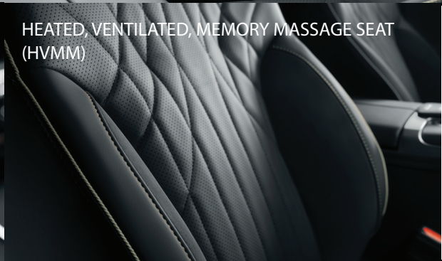
HEATED, VENTILATED, MEMORY MASSAGE SEAT (HVMM)