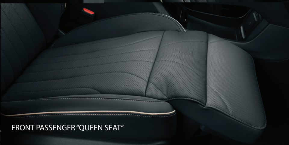
FRONT PASSENGER "QUEEN SEAT"